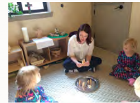
Sitting in the circle, listening to the story

Toddlers may be dropped off in the nursery anytime after 8:15. At approx. 10:00, they will be invited in to Godly Play by their teachers. They share a story and then prepare a feast to enjoy together. Afterwards, they enjoy washing and drying their dishes. They return to the nursery to play at approximately 10:30 and may be picked up afterwards.