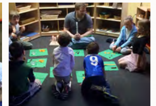
Sharing a prayer time together before the feast