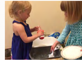
Taking care of the classroom materials together

After the Children's Assembly, primary students will proceed to Godly Play with their guides. They hear a story and then are invited to make an individual response, using art supplies and other materials. They then share a feast together and go outside for a recess at 10:40. They may be picked up at that time, or they may return to their Godly Play room for an optional extension through the Peace at the 11:00 mass, at which they will join their families.