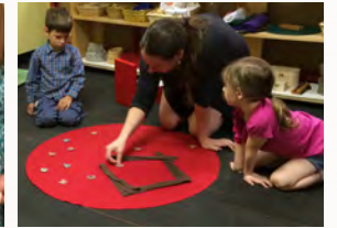
Listening intently to a more complex story