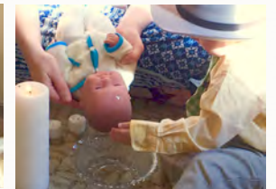
Hands on engagement with the story materials