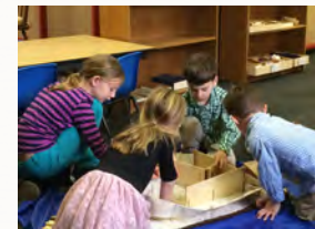
Working together with peers in response to a story

Elementary students move with their guides to Godly Play from the Children's Assembly. They hear a story and then have time for individual or group responses, followed by a feast. Elementary students may be picked up at Garrison Hall upstairs at 10:40.